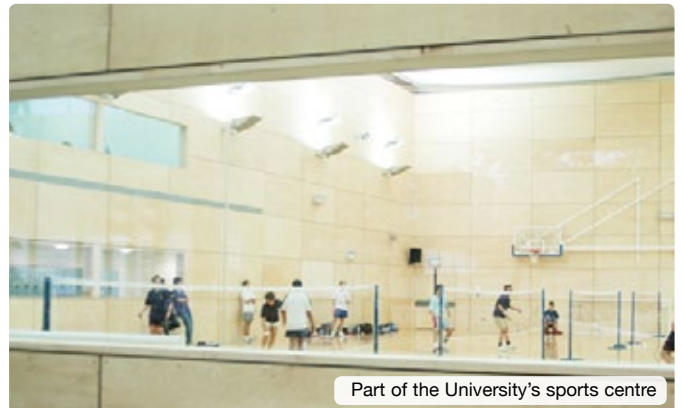
Part of the University's sports centre