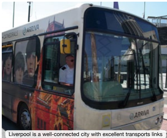
Liverpool is a well-connected city with excellent transports links

Note: students who travel independently must inform the College of their flight and travel arrangements. If the College is not informed, the student may only access their accommodation within office hours (09:00 – 17:00, Monday to Friday) when they first arrive. If they arrive in Liverpool outside of these hours, they must arrange alternative accommodation for the first night(s).