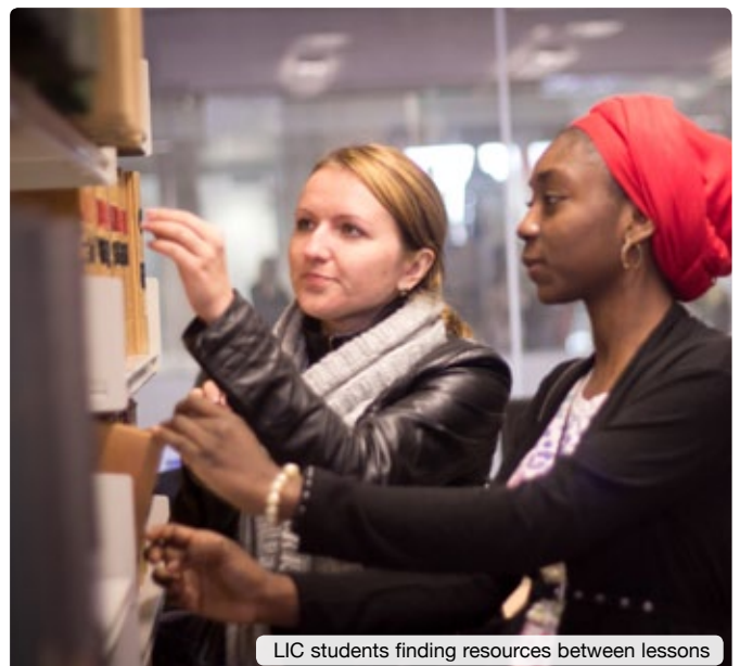
LIC students finding resources between lessons