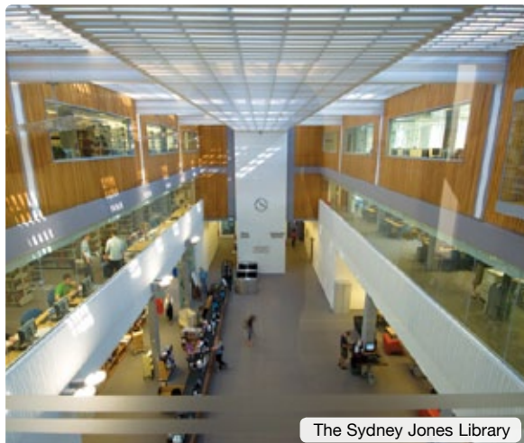
The Sydney Jones Library

LIC arranges a variety of social activities for students ranging from parties, shopping trips and theme parks to day trips to the beautiful English countryside. It is recommended that students join the LIC Society to make the most of extra-curriculum activities and enjoy the benefits of student discounts