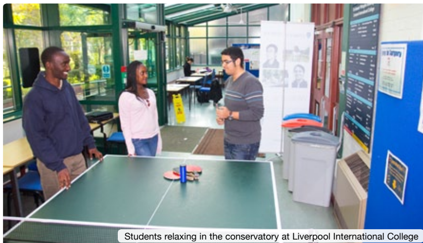
Students relaxing in the conservatory at Liverpool International College