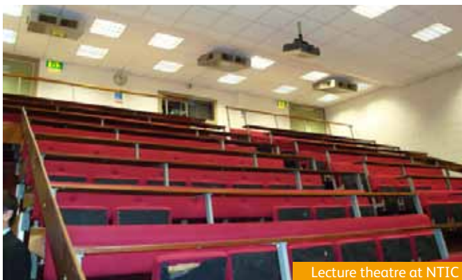
Lecture theatre at NTIC