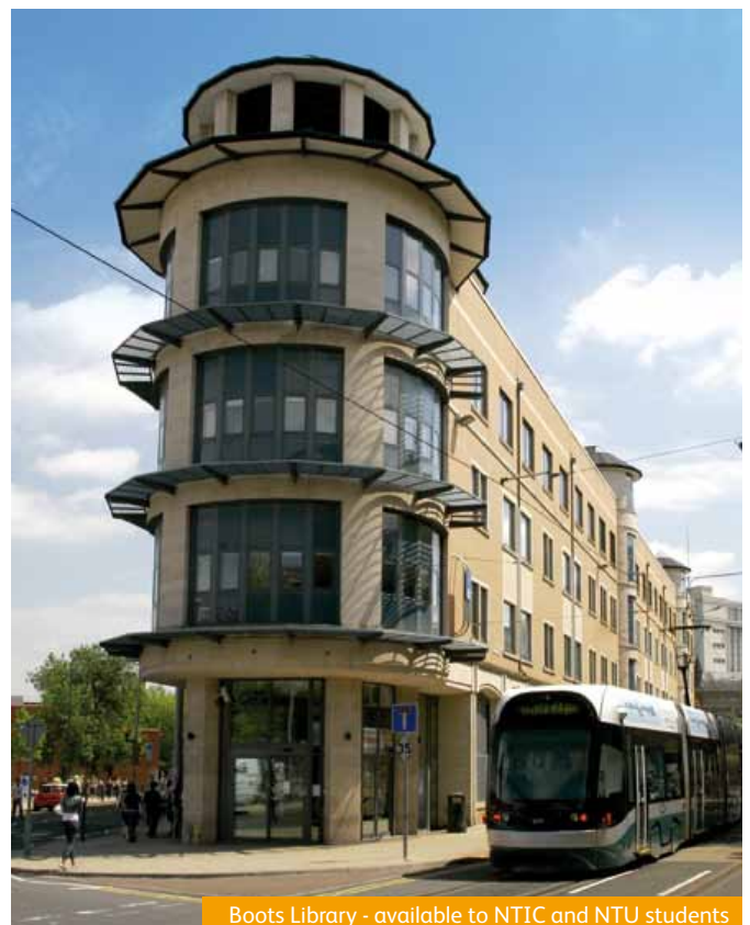
Boots Library - available to NTIC and NTU students