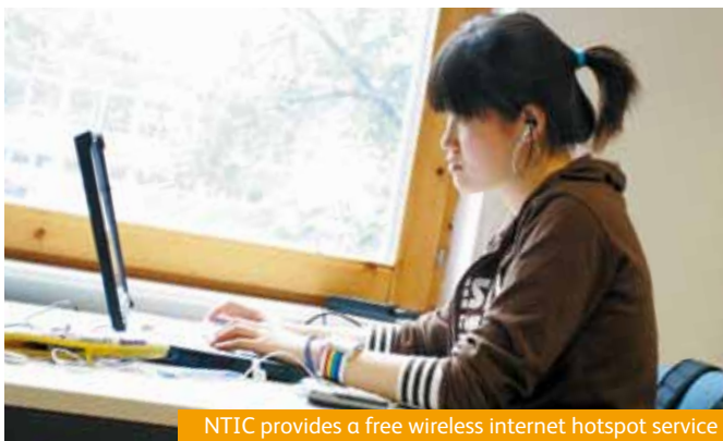
NTIC provides a free wireless internet hotspot service