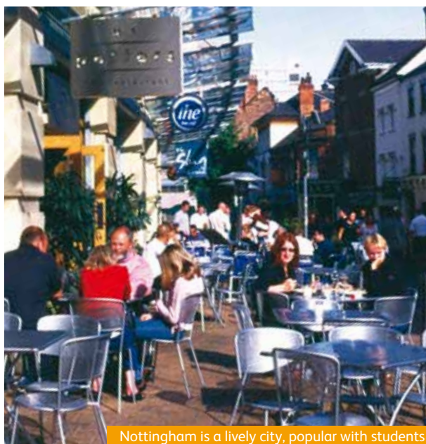
Nottingham is a lively city, popular with students