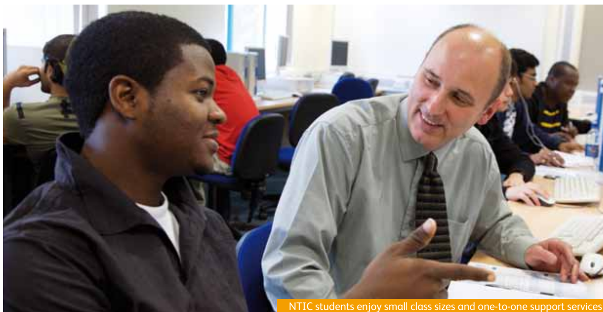
NTIC students enjoy small class sizes and one-to-one support services

Standard voltage in the UK is 240 volts. To make sure that you are able to use all your electrical appliances bring an adaptor with you.