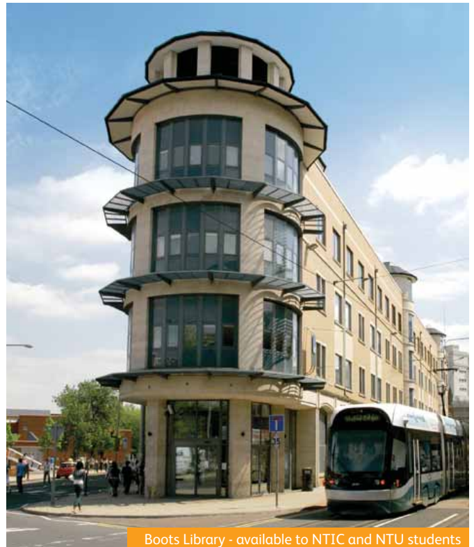
Boots Library - available to NTIC and NTU students