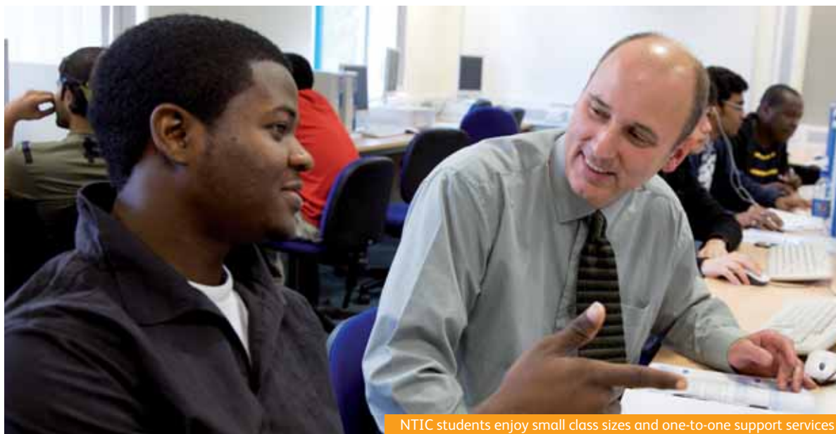
NTIC students enjoy small class sizes and one-to-one support services

Standard voltage in the UK is 240 volts. To make sure that you are able to use all your electrical appliances bring an adaptor with you.