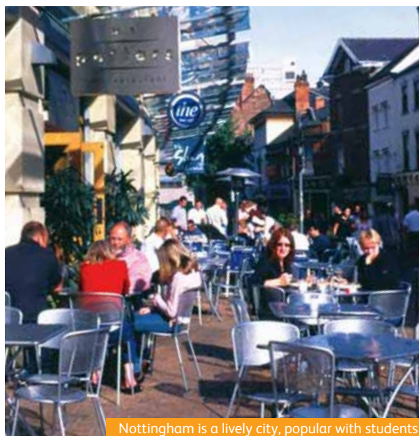
Nottingham is a lively city, popular with students