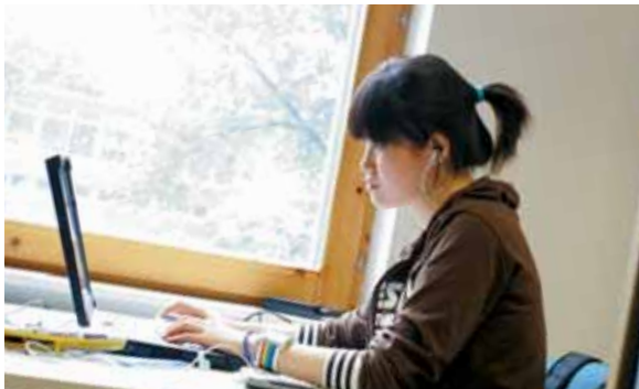
NTIC provides a free wireless internet hotspot service