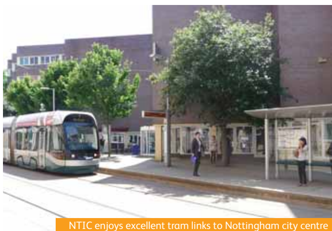
NTIC enjoys excellent tram links to Nottingham city centre

Note: students who travel independently may only access their accommodation within office hours (0900-1600, Monday to Friday) when they first arrive. If you arrive in Nottingham outside of these hours, you must arrange alternative accommodation for your first night(s).