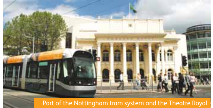
Part of the Nottingham tram system and the Theatre Royal

There are places of worship for all religions and faiths close to the college. A list of these and their locations is posted at the college.