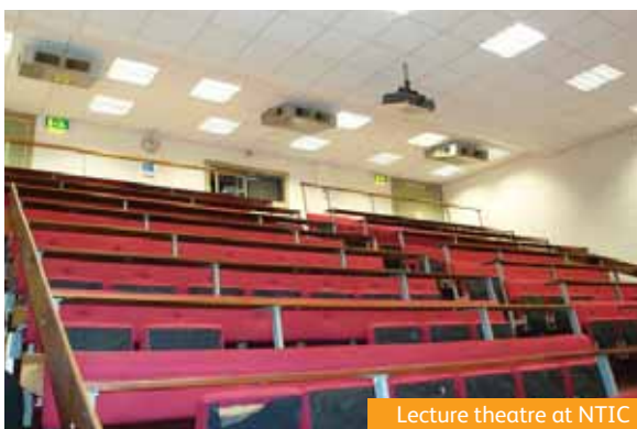
Lecture theatre at NTIC