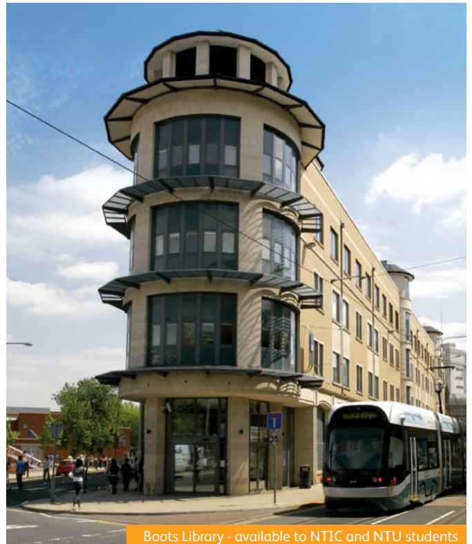
Boots Library - available to NTIC and NTU students