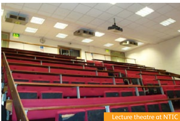
Lecture theatre at NTIC