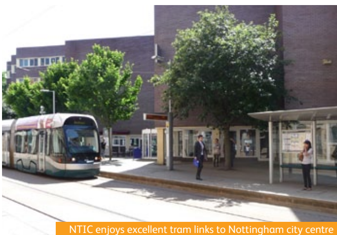
NTIC enjoys excellent tram links to Nottingham city centre

Note: students who travel independently may only access their accommodation within office hours (0900-1600, Monday to Friday) when they first arrive. If you arrive in Nottingham outside of these hours, you must arrange alternative accommodation for your first night(s).