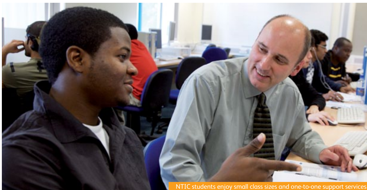
NTIC students enjoy small class sizes and one-to-one support services

Standard voltage in the UK is 240 volts. To make sure that you are able to use all your electrical appliances bring an adaptor with you.