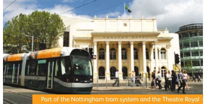
Part of the Nottingham tram system and the Theatre Royal

There are places of worship for all religions and faiths close to the college. A list of these and their locations is posted at the college.